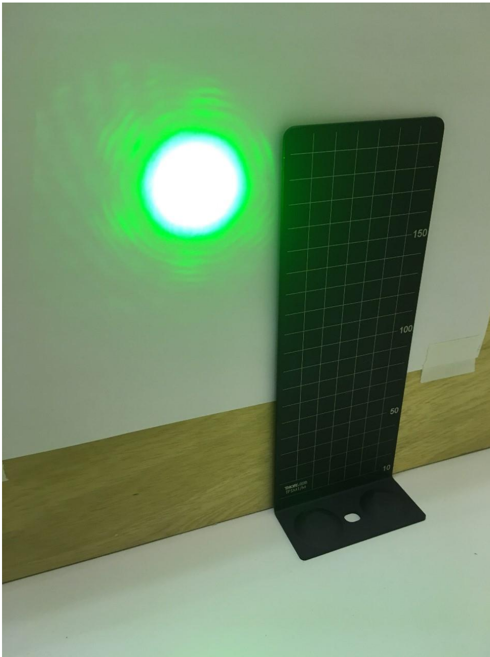
Fig. 2 Supercontinuum Beam at 532nm (Green)